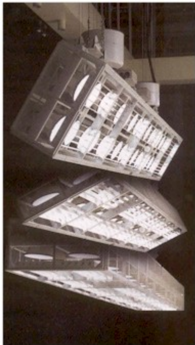
Programmable array elevation, tilt, and shutter systems provide uniform lighting profiles

When Toyota Motor Corporation developed requirements for their new testing facility, they sought the help of a company they could trust to provide a complete engineered lighting solution.